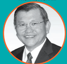
ONG SEE LIAN