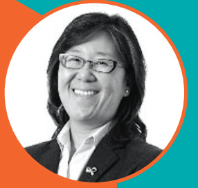
TAN SWEET IM