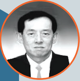
SAW SOON KOI