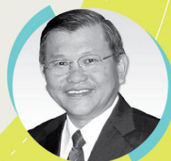
ONG SEE LIAN