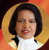
JUSTICE DATUK NALLINI PATHMANATHAN JUDGE OF THE COURT OF APPEAL OF MALAYSIA