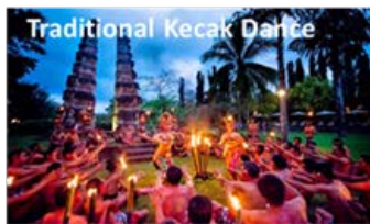
Traditional Kecak Dance