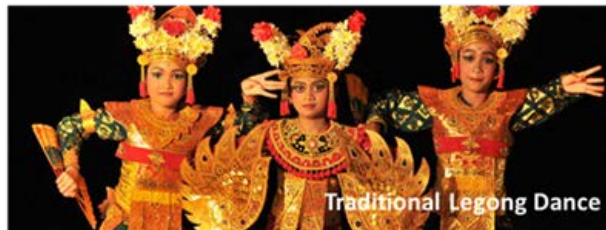
Traditional Legong Dance