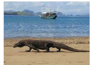
Komodo Dragon Island