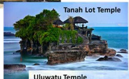
Tanah Lot Temple