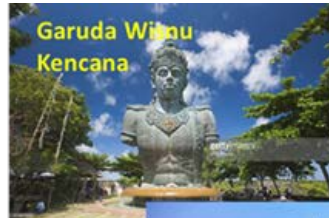
Garuda Wisnu Kencana